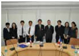
French Embassy Scholarship Program