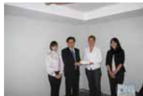
DAAD Scholarship Support