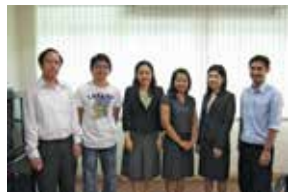
A German Scholarship Event